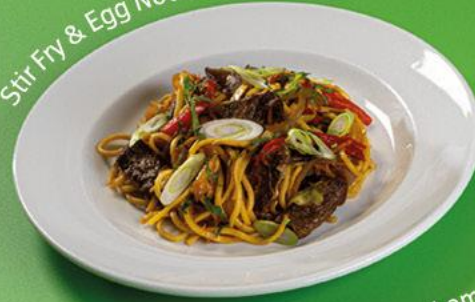
Stir Fry & Egg Noodles