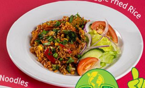
Stir Fry & Egg Noodles