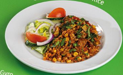
Garden Veggie Fried Rice