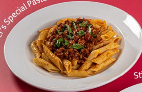
Chef's Special Pasta Bolognese